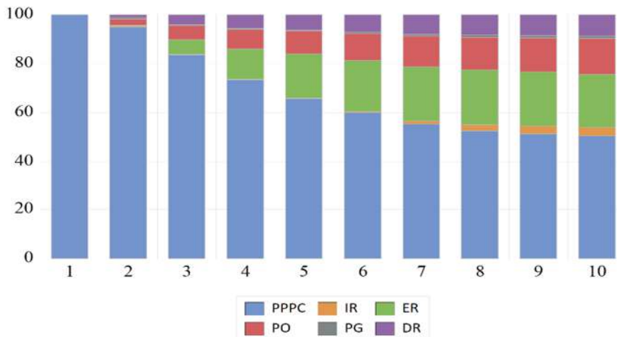
Fig 3. Variance Decomposition Graph